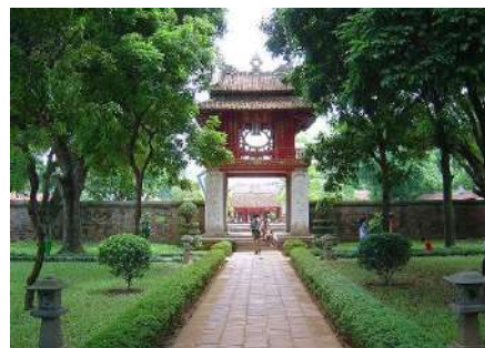
Temple of Literature End of services!