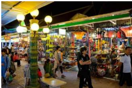
Halong night market

Distance Noi Bai Airport – Hanoi Central: 35 km => 45 minute transfer