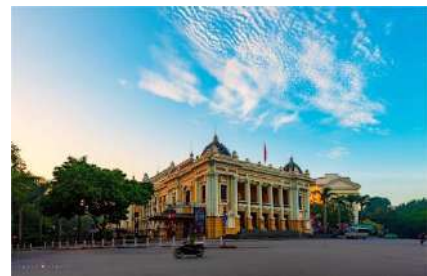
Opera House Hanoi