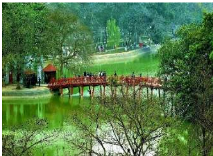
Ngoc Son Temple

Distance Hanoi Central – Noi Bai Airport: 35 km => 45 minute transfer