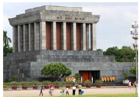
Ho Chi Minh Mausoleum