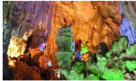
Paradise Palace cave