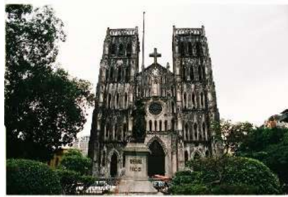
St. Joseph's Cathedral, Hanoi